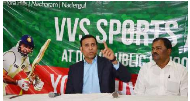
Shri V V S Laxman Former Indian Cricket Player