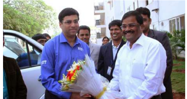
Viswanathan Anand Indian Chess Grandmaster