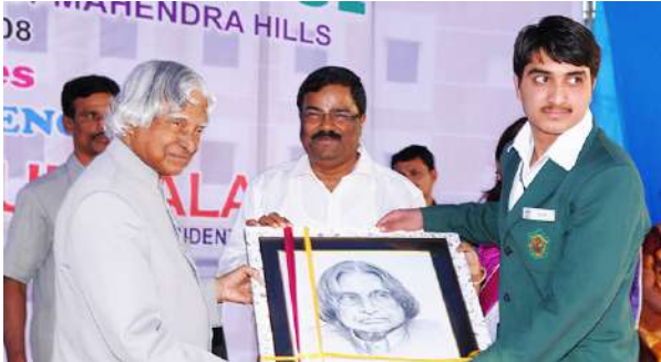
Shri A P J Abdul Kalam Ex - President of India