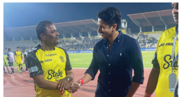
Mr. Naga Chaitanya Indian Actor