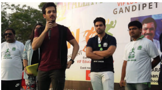
Mr. Akhil Akkineni Indian Actor