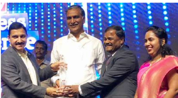
Shri Sujana Chowdary Minister of Science, Technology & Earth Sciences