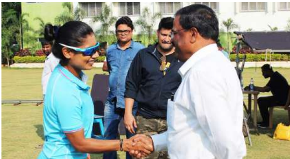
Ms. Mithali Raj Captain of Indian Women's cricket team