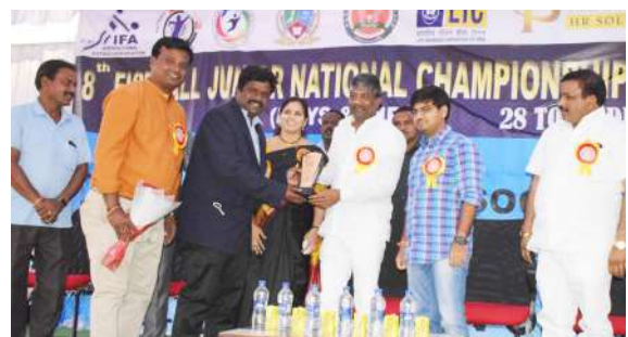
Shri T. Padma Rao Goud Sports & Exercise Minister