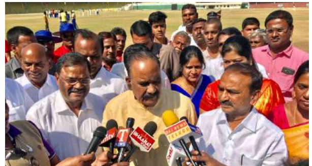
Shri Narasimha Reddy Home Minister of Telangana