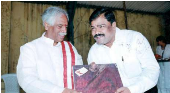
Shri Bandaru Dattatreya Minister of Labour & Employment