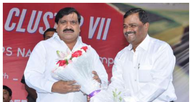
Shri P. Mahender Reddy Minister of Telangana Transport Department